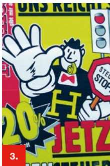
Example 3 ORACAL® 1670

These films have been developed for high quality screen printing, UV-offset and flexoprinting. In cases where a high degree of humidity may affect the bonding of the material, ORACAL® 1650 series is the perfect choice with its water-resistant high performance acrylic adhesive. ORACAL® 1630 is recommended for applications where the film needs to be removed without residue even after a two-year bonding period. Both films are suited for short and medium-term exterior use: for markings, inscriptions and decorations.