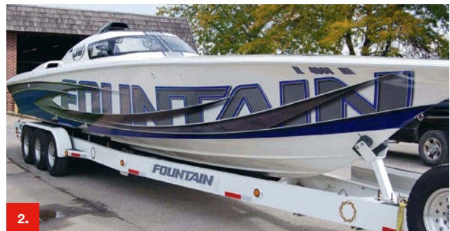
Example 2 ORACAL® 1050