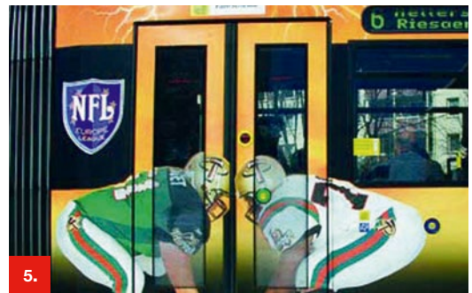
Example 5 ORACAL® 1668