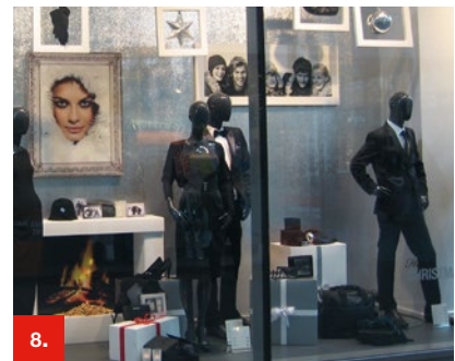
Example 8 ORACAL® 1640HT