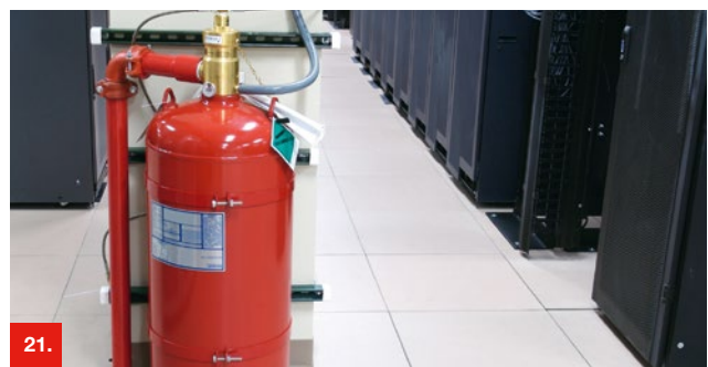
Example 21 ORACAL® 820