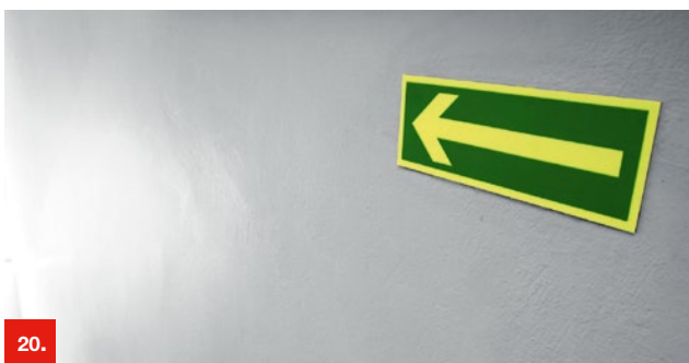
Example 20 ORALUX® 9300

This special white PVC cast film with a matt surface displays a very low tear and tear propagation resistance. This means that the self-adhesive film can only be removed in small segments, thus protecting against fraud. The permanent solvent polyacrylate adhesive meets most demanding standards. The film is suited for strong adhering stickers with document character. Removal and re-use is impossible. We recommend screen printing, ink jet printing with solvent-based inks, UV and latex inks is also possible. In addition, ORACAL® 820G is available with a gloss surface.