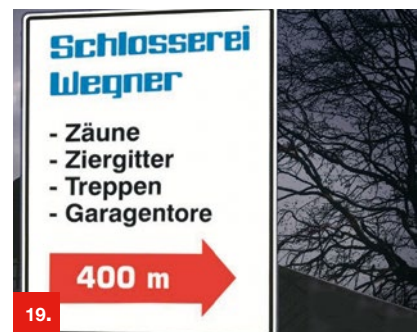
Example 19 ORALITE® 5200