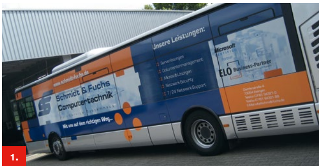
Example 1 ORACAL® 952 / 953

The ORACAL® 552 series of light-fast and weather resistant material, is designed for long-lasting high quality vehicle decorations. It comes in white and transparent with glossy surface. The permanent seawater resistant high performance acrylic adhesive meets all the highest requirements. Possible applications are high quality screen printing for outdoor lettering, decorations and marking of products with high demands on resistance and durability.