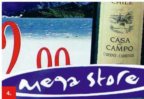
Example 4 ORACAL® 1650