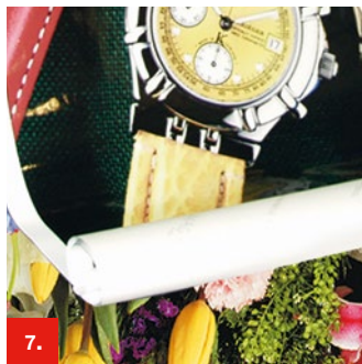
Example 7 ORACAL® 1610