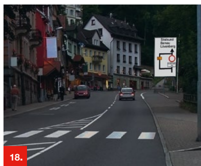
Example 18 ORALITE® 5300