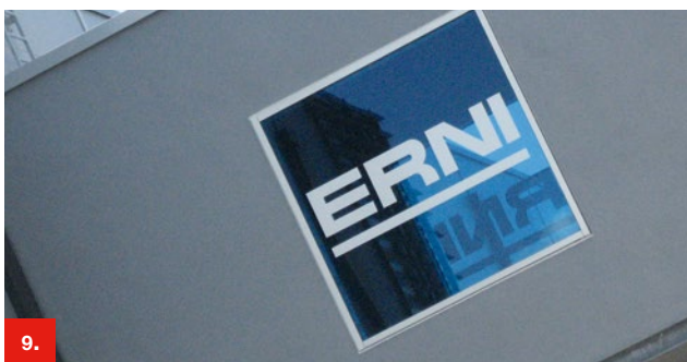
Example 9 ORACAL® 1680

These health friendly, very soft PVC films are suited for short and medium term outdoor applications such as markings, inscriptions and decorations. Indoor exposure is almost unlimited. The films fulfil the requirements of the European directives 2005/84/EC (phthalates in toys and child care articles). Series 640PF is equipped with a permanent, series 620PF with a removable adhesive.