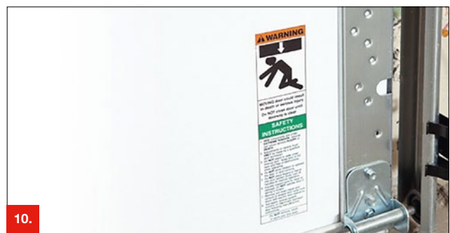
Example 10 ORACAL® 620