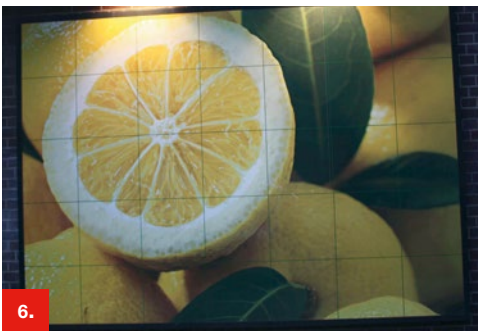
Example 6 ORACAL® 1640

For ORAFOL® Floor Graphics systems in connection with ORAGUARD® 250AS or 255AS. Excellent opacity suppressing colour shadows of the floor surface. The adhesive guarantees clean removal.